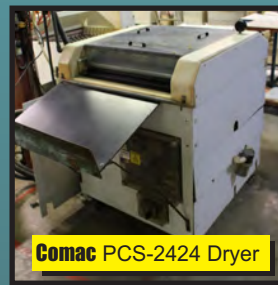
Comac PCS-2424 Dryer