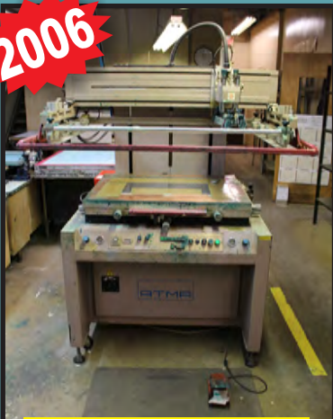
Atma AT-EW80P Semi Auto PCB Wet-Film Screen Printer