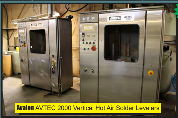
Avalon AVTEC 2000 Vertical Hot Air Solder Levelers