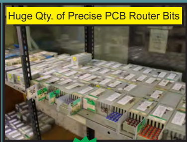
Huge Qty. of Precise PCB Router Bits