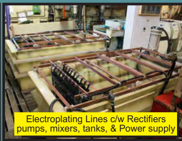
Electroplating Lines c/w Rectifiers pumps, mixers, tanks, & Power supply