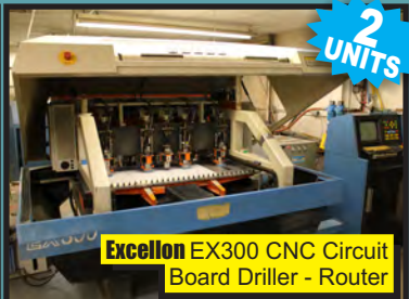
Excellon EX300 CNC Circuit Board Driller - Router