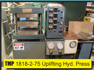
TMP 1818-2-75 Uplifting Hyd. Press