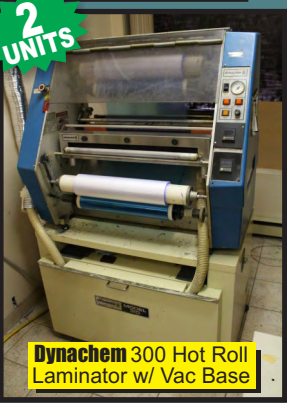
Dynachem 300 Hot Roll Laminator w/ Vac Base