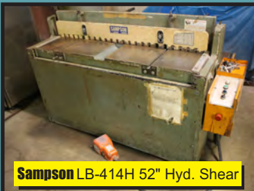
Sampson LB-414H 52" Hyd. Shear